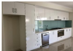
January 2017 Fit Out