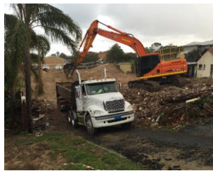
May 2016 Demolition