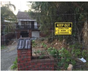
May 2016 Permit