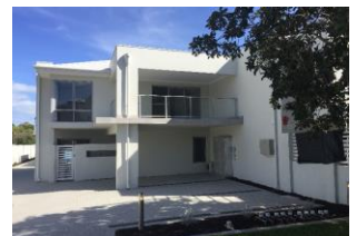
February 2017 Handover