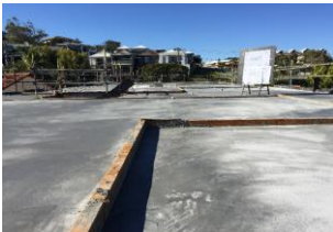
August 2016 Suspended Slab