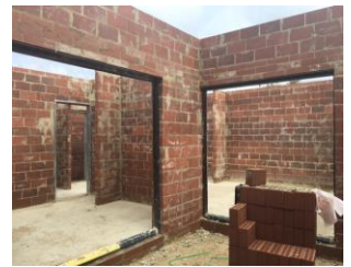
July 2016 Ground Brickwork