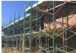
September 2016 Upper Brickwork