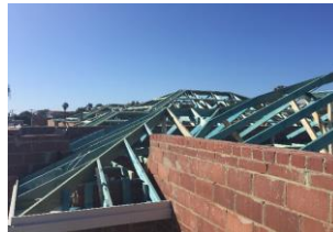
September 2016 Roof Frame