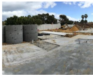
June 2016 Ground Slab