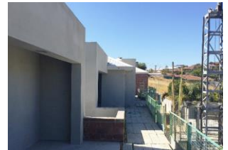
October 2016 Render & Roof Cover