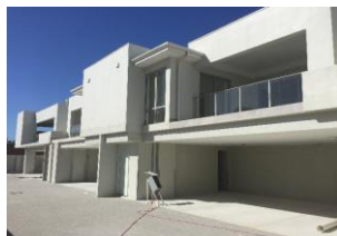
December 2016 External Works