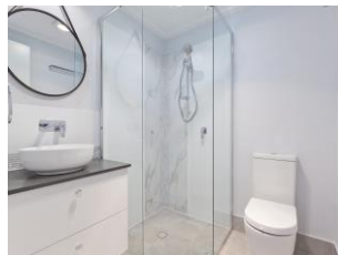
February 2018 Tiling, Screens & fit off