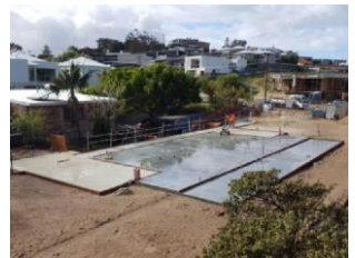
August 2017 Ground Floor Slab