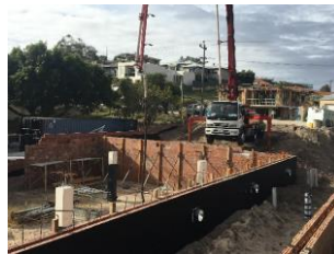
June 2017 Site Works, Basement Carpark