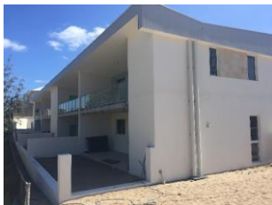
December 2017 Ext. Render, Int. Fit Out