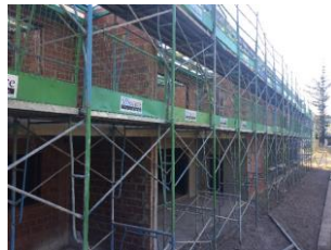
October 2017 First Floor Brickwork