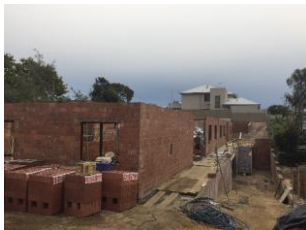
September 2017 Ground Floor Brickwork