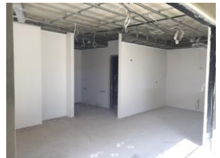
November 2017 Roof Frame, Internal Render