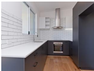
January 2018 Balustrade & Int. Fit Out