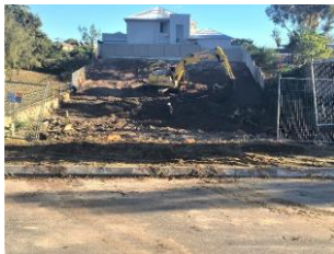
May 2017 Demolition