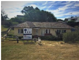
May 2017 Existing House